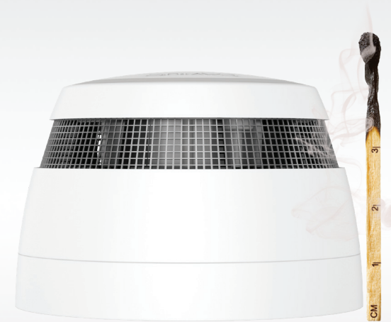
Diameter: 65 mm

PRODUCT NAME: CAVIUS RF SMOKE ALARM, 5 YEAR 65MM